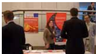
WBC-INCO.NET exhibition stand at the E2C Conference

WBC-INCO.NET supported the participation of 18 energy experts from the Western Balkan countries and 6 project partners. Furthermore, WBC-INCO.NET was present at the Conference with an exhibition stand to showcase energy excellence in the region.