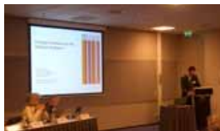
Consultation Session in the field of Energy

The conference programme combined plenary keynote presentations on diverse energy themes with devoted symposia in specialised fields. Keynote lectures were given on overarching subjects of energy and associated climate research. Thematic symposia addressed more specific topics of the symposia.