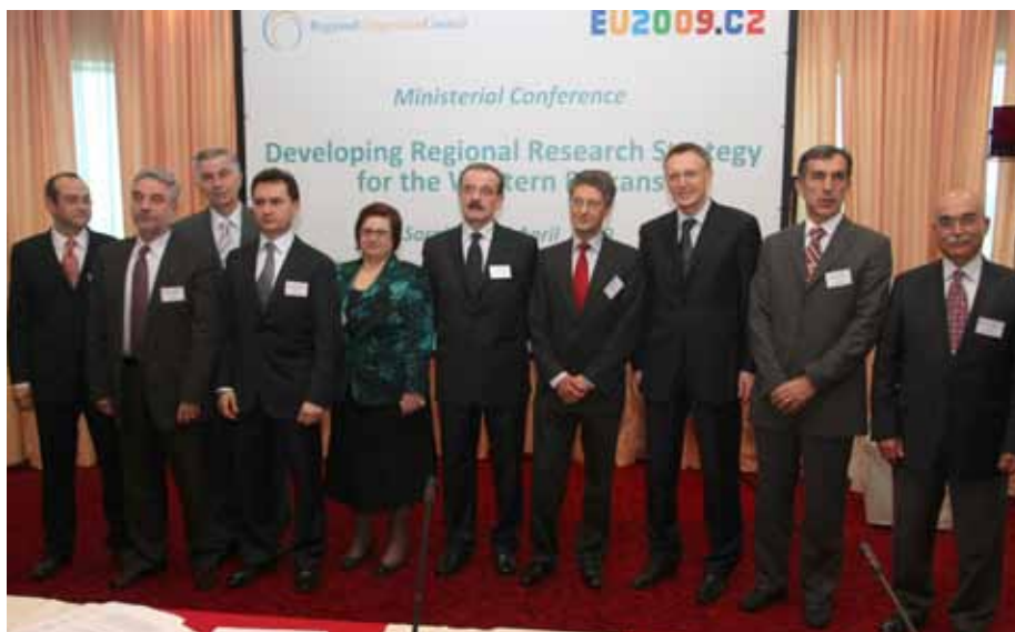
Ministerial Conference "Developing Regional Research Strategy for the Western Balkans", Sarajevo, Bosnia and Herzegovina, April 24, 2009

The first half of the two-year technical assistance project will focus on knowledge sharing and preparation of the draft strategy as well as country action plans by the beneficiary entities. The remaining twelve months would be dedicated to the consultation/dissemination of the draft strategy among the different stakeholders in the region and preparation of the final draft strategy and action plans.