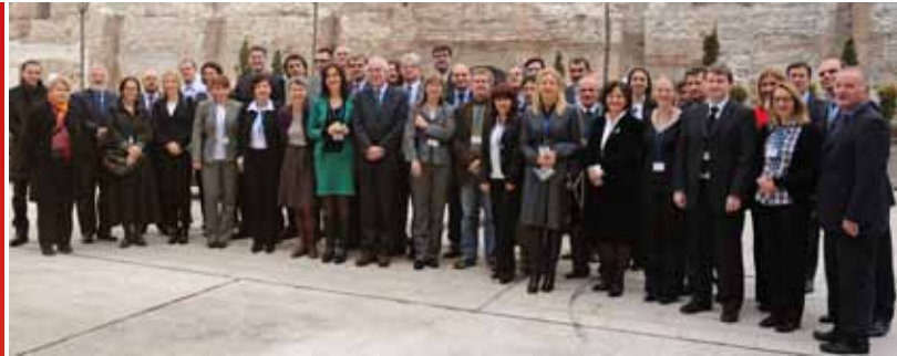
11 th Meeting of the Steering Platform, Sarajevo, Bosnia and Herzegovina

Western Balkan Countries INCO-NET Information Office of the Steering Platform on Research for the Western Balkan Countries c/o ZSI – Centre for Social Innovation Linke Wienzeile 246, 1150 Vienna, Austria tel.: +43 1 4950442-62, fax: -40 e-mail: office@wbc-inco.net ISSN 1991-1750 Subscription and recent issues: http://wbc-inco.net/object/link/10060