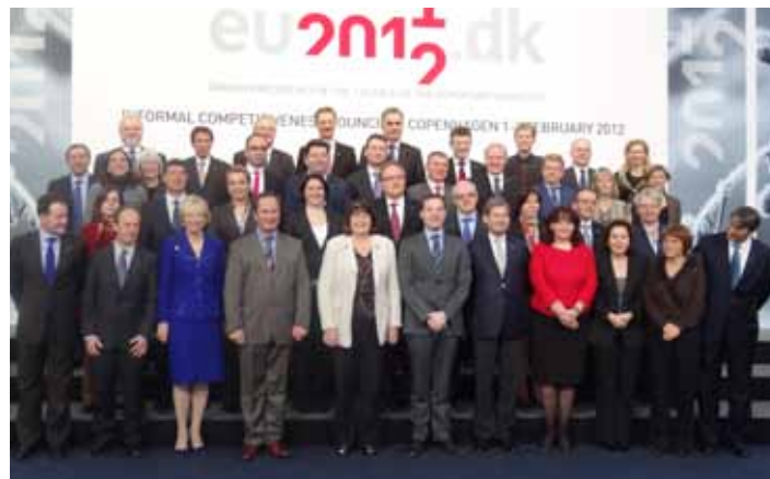
Ministerial Conference on Horizon 2020, February 2012