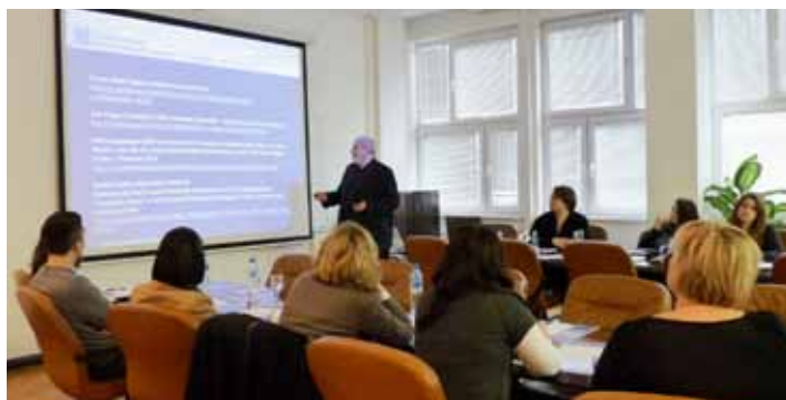
4 th Training for representatives of the University of Zagreb, organised within the project “ Mapping Technology at the University of Zagreb ”, held 2011

Beneficiaries of the first call include a number of successful projects: the project “ Technology mapping at University of Zagreb ”, beneficiary University of Zagreb. The project includes five partners at the University of Zagreb: the Faculty of Agriculture, the Faculty of Chemical Engineering and Technology, the Faculty of Food Technology and Biotechnology, the Faculty of Science, and the School of Medicine; and three associates: the Croatian Agency for SMEs (HAMAG), the Croatian Chamber of Economy, and the Croatian Employers Association. The overall objective of the project is to strengthen technology transfer and commercialization capacities of the University of Zagreb in order to contribute to sustainable regional development and industry competitiveness of high value added sectors of the economy and knowledge-based industry and SME's in Croatia.