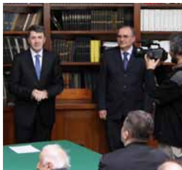
Celebration of the 125 th Anniversary of the Astronomical Observatory