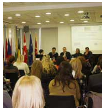
Promotion of the Research Study “Detour: Europe via Community Programmes”

For the purpose of effective utilization of available funds, FYR of Macedonia has to implement a broad consultation process and it has to define its development strategy in compliance with Europe 2020. This process should be complemented with sector-specific developmental policies and relevant national financial instruments that would make due consideration of Community Programmes, and in particular of IPA, as complementary instruments to attain the goals and objectives defined therein. The state should reconsider the establishment of an earmarked fund that would be used to finance projects and that could be sustained from additional taxes levied on lottery games. The study has shown that the country is most successful in FP7, with a total of 71 approved projects.