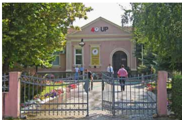
University of Prishtina Rectorate