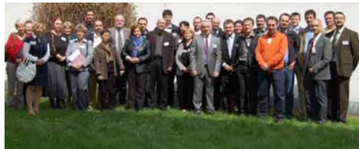
Participants of the Monitoring Meeting in Vienna, April 23–24, 2012

All coordinators attended the meeting and presented in 4 concurrent panels the achievements of the projects. Short presentations by the coordinators – using a predefined set of questions – were followed by lively discussions among the coordinators. Although many of the projects started with a delay of several months, most of the objectives of the projects could be achieved. In a joint session, all coordinators were invited to give feedback on the administrative processes of the projects and the support provided by the Joint