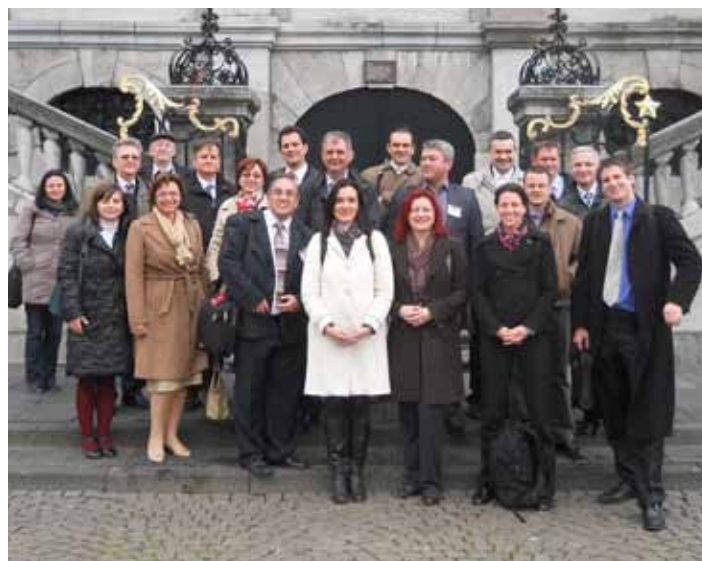
Participants of the Consultation Session in the field of Energy in front of the Maastricht Town Hall

LINKS Find the agenda and presentations here ▪ http://wbc-inco.net/object/event/9582 Videos available: WBC-INCO.NET at E2C Maastricht ▪ http://wbc-inco.net/object/news/3532