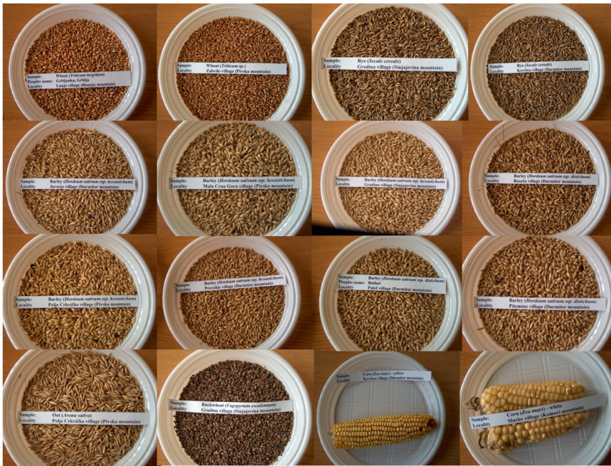
Figure 5. A part of the samples collected in Montenegro through six years period, consisting of cereals, mainly. The unique sample of local population Grbljanka ( T. turgidum ), the first sample on the left in the top row.