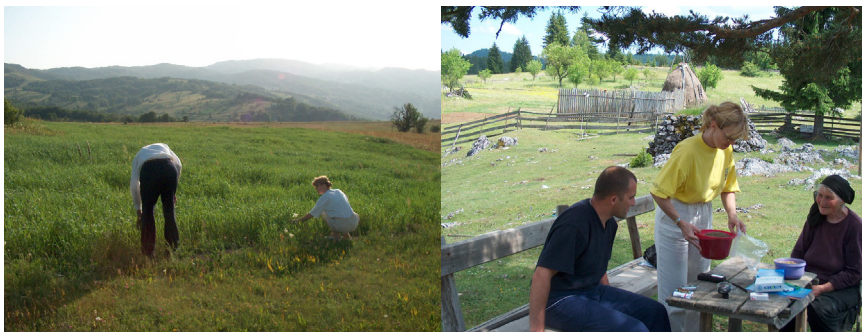
Figure 6. Wheat field in village Zabrdje (long. 43.13366°N, lat. 18.76251°E, alt. 1381m) at Golija mountain. Seed inherited from grandfather in a self sufficient production (on the left). Village Gradina (long. 43.10027°N, lat. 19.29078°E, alt. 1232m) at Kričak Mountain. Inherited seed of barley, rye and buckwheat still in sowing (on the right).