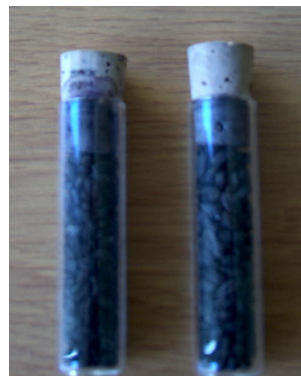
Figure 1. Einkorn (right) and millet (left) seed founded at Neolithic locality Kalakača near Beška village in Vojvodina, northern part of Serbia.

form the Early Iron Period charred einkorn and millet seeds were found (Fig. 1). Comparing these migrations both starting in Anatolia at the almost same period, but in different directions, as well as, later archeological findings, it could be concluded that wheat and some other cereal utilization for food and feed on the Balkans proceeds from the very dawn of civilization 10 .