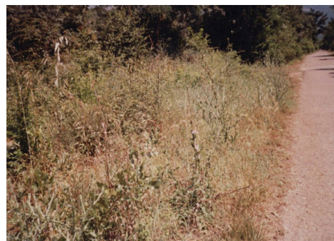
Figure 3. The photo on the left shows locality Martinići (Montenegro) the only A. uniaristata population found in 1986. The photo on the right shows the same locality in 2003, with no trace of A. uniaristata .