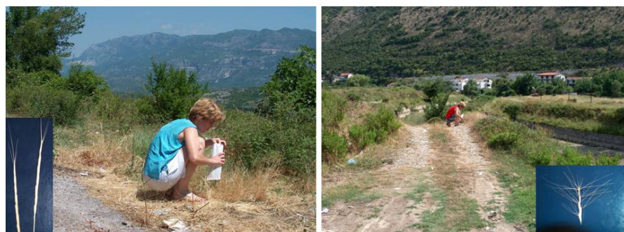
Figure 8. The locality by the road Podgorica - Nikšić, where Aegilops cylindrica was found (photo on the right). Sutorina locality, where Aegilops kotschy was first time spotted and collected in 2003 (photo on the left corner).

The results of six years field research of Aegilops genus diversity in inland and coastal part of Montenegro revealed six species of